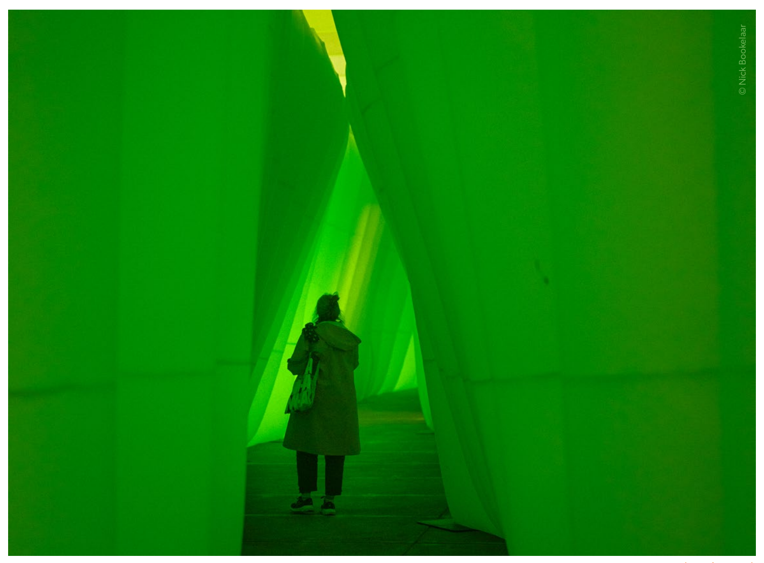
Dutch Design Week