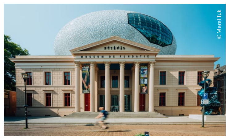
Museum de Fundatie