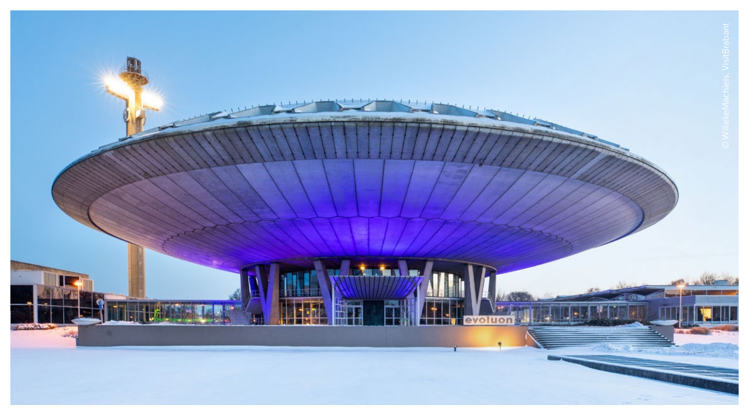
Evoluon in Eindhoven