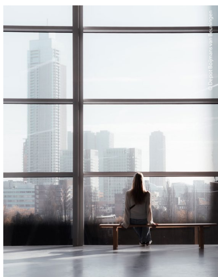
Depot Boijmans van Beuningen