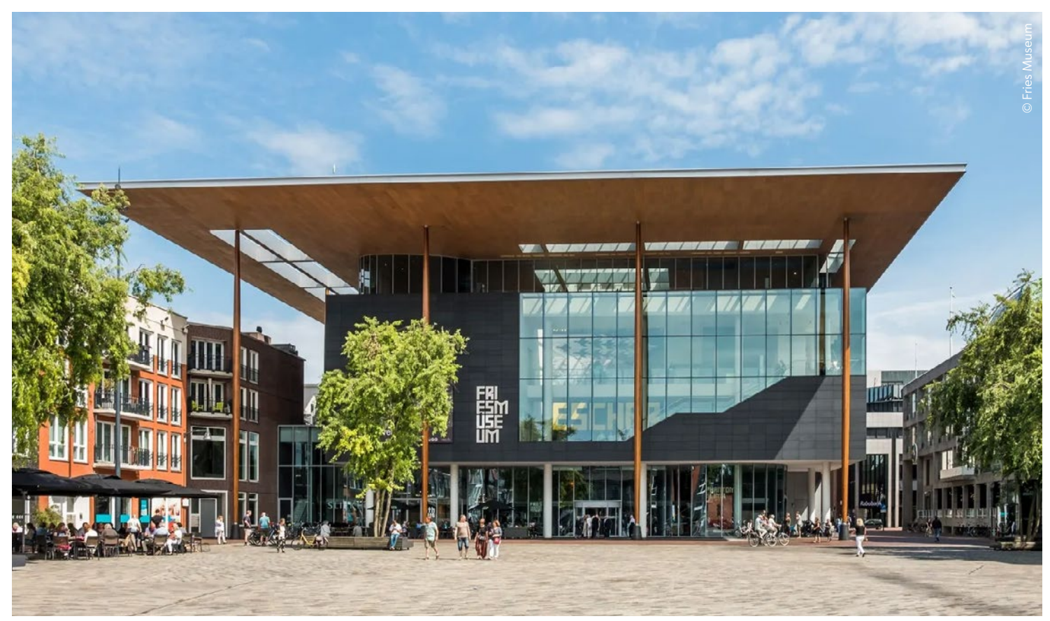
Fries Museum Leeuwarden