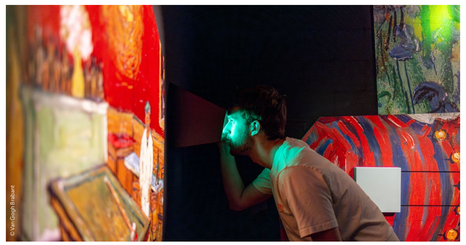
Van Gogh Village Museum in Nuenen