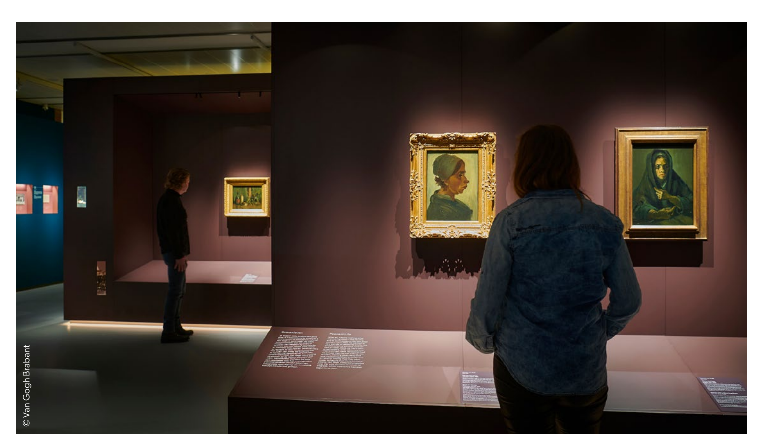
Van Gogh collection in Het Noordbrabants Museum in Den Bosch