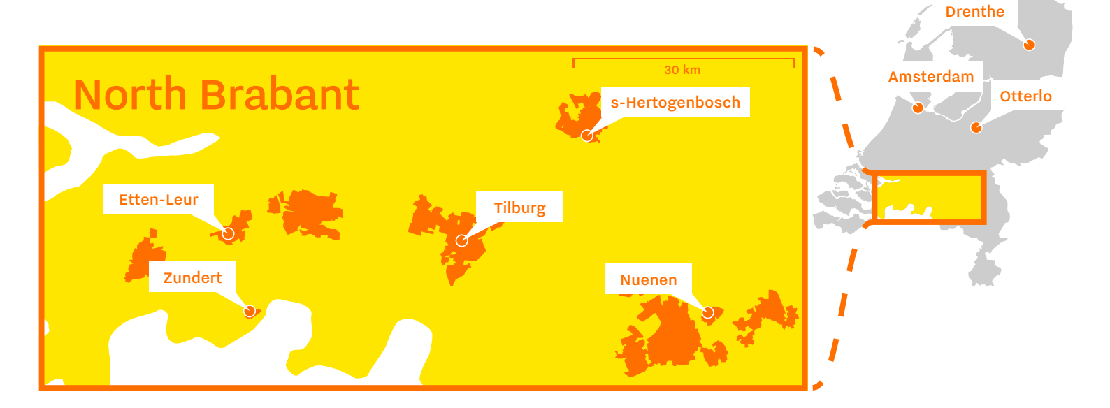
Vincent van Gogh Huis in Zundert

His paintings reflect the beauty of Dutch landscapes, farm life and the rich cultural history and the heritage of the Netherlands. Despite only a short creative period of about 10 years, his legacy spans more than 900 paintings and over 1,000 drawings.