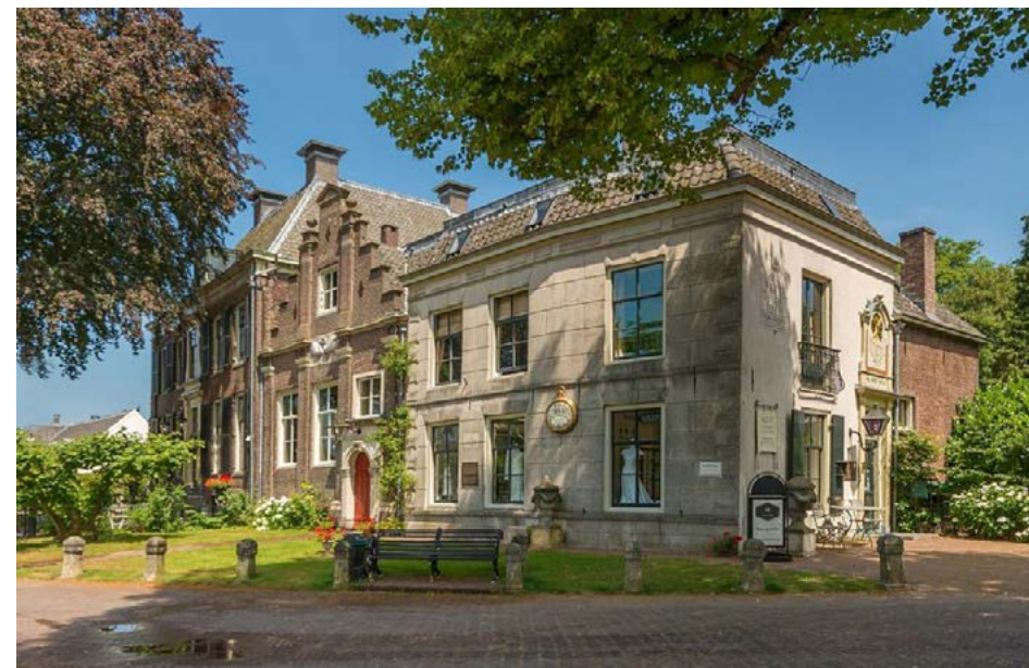
The beautiful lodging Swaenenvecht houses unique historic rooms