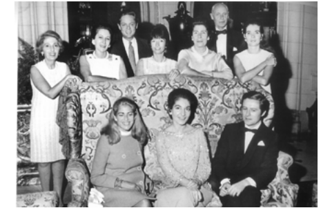
Brigitte Bardot, Roger Moore, Coco Chanel and many others visited De Haar Castle.