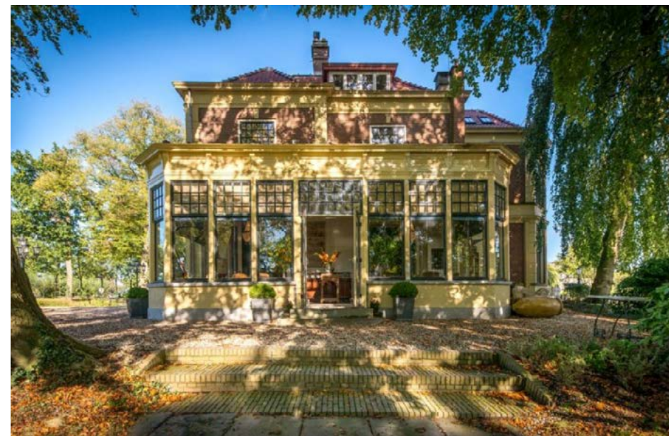
Experience merchants opulence and grandeur of Logement aan de Vecht